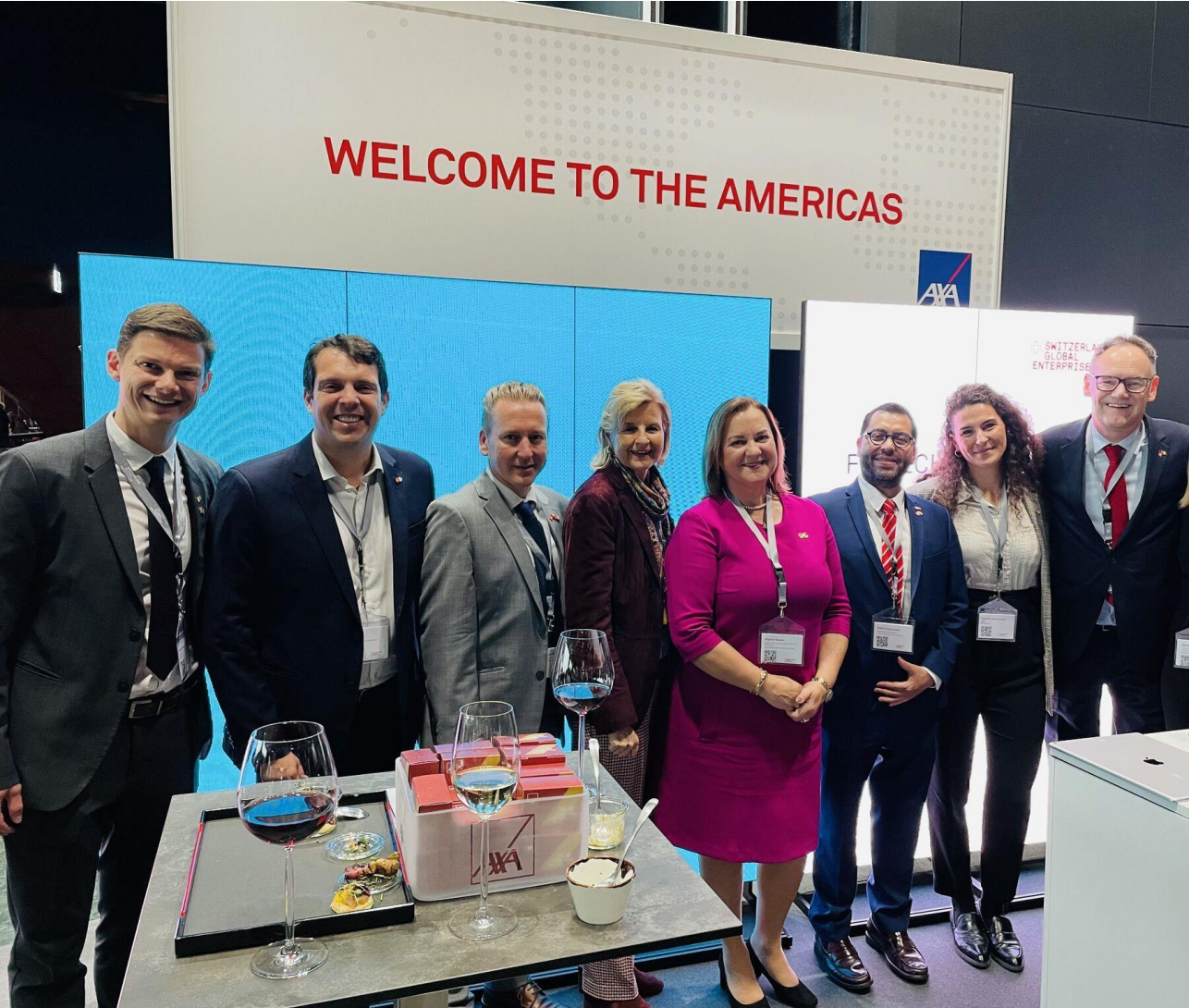
Get together of S-GE LATAM Team and Latcam at International Trade Forum in Lucerne, spring 2022.